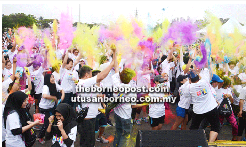
A file photo from last year's Colour Rush charity run in Miri.

MIRI: The success of the recent Go Bald campaign by Sarawak Children's Cancer Society (SCCS) – during which RM818,705 was raised through the shaving of 978 heads – has given SCCS confidence in staging a successful Colour Rush charity run in September.